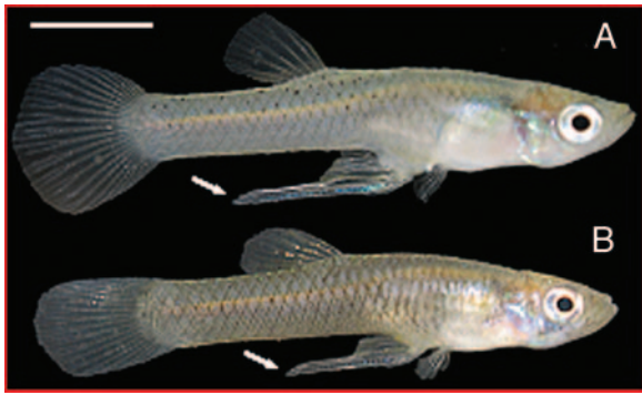
Fig. 3. Representative laboratory-reared G. affinis males derived from predator-free (A) and predator (B) populations. Arrows indicate the gonopodia. Note the larger gonopodium in A. (Bar, 5 mm.)

Thus, larger gonopodia of males in predator-free populations seem to reflect, at least in part, the influence of female mate choice on the evolution of male genital size.